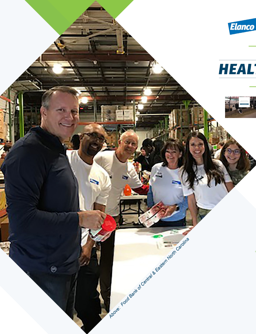
Above: Food Bank of Central & Eastern North Carolina