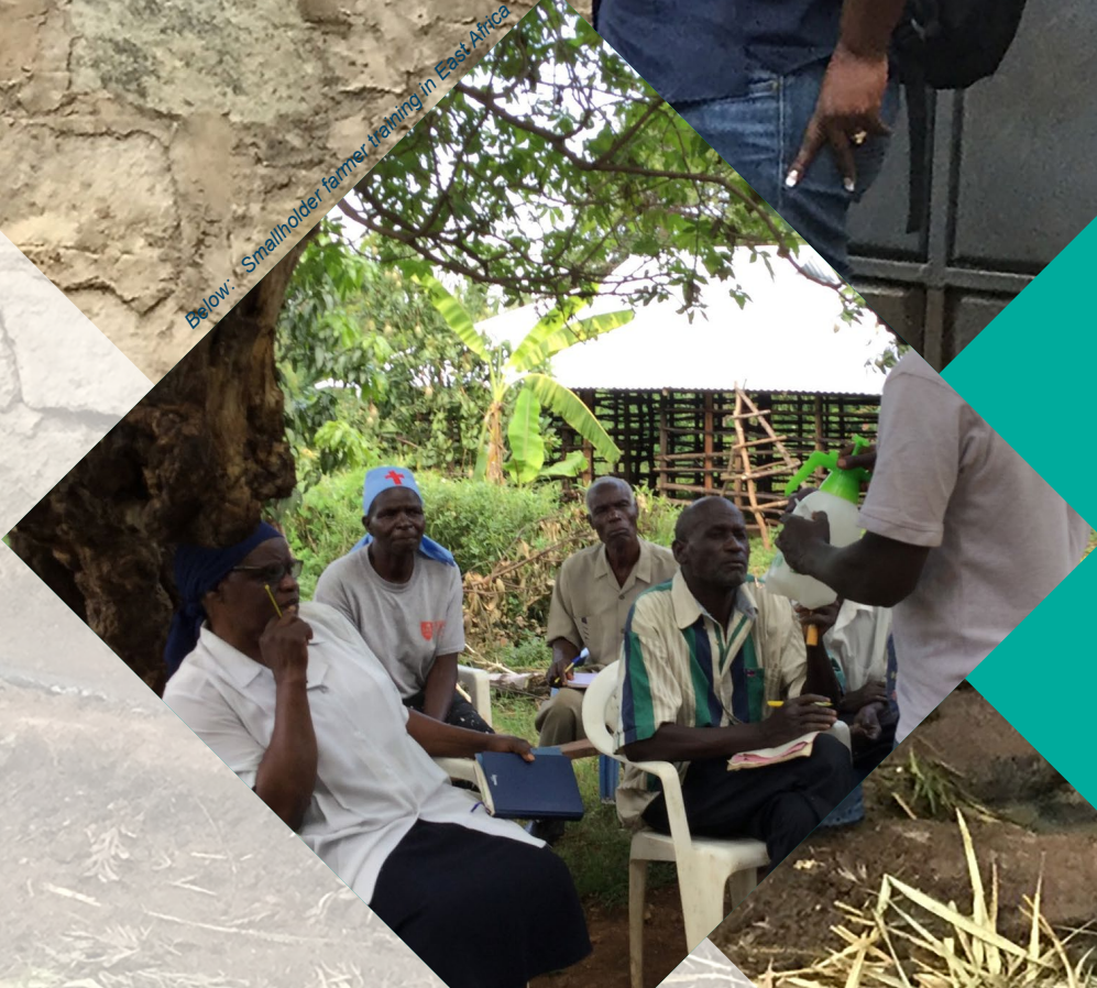
Below: Smallholder farmer training in East Africa

Livestock disease is a significant threat to achieving food security globally. In East Africa, 25 percent of livestock currently raised are lost due to animal illness. 4 Launched in 2017 with a $3.1 million grant from the Bill & Melinda Gates Foundation®, our EAGA shared value initiative aims to empower farmers with the knowledge and medicine they need to care for animals and enable the growth of their communities, reducing animal mortality and poverty, increasing farmer's income and improving diets and health of local families.