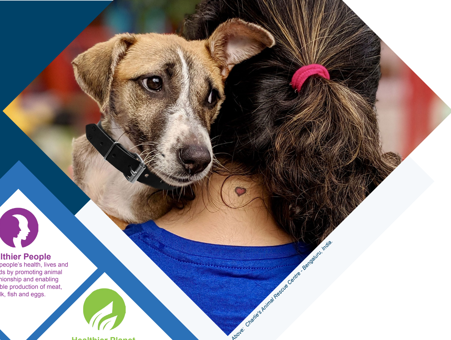
Above: Charlie's Animal Rescue Centre - Bengaluru, India.