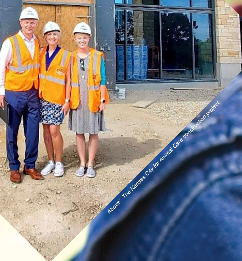
Above: The Kansas City for Animal Care construction project.

The new campus, which opened in January 2020, will house KC Pet Project, which Elanco supports through Paws 4 Purpose™.