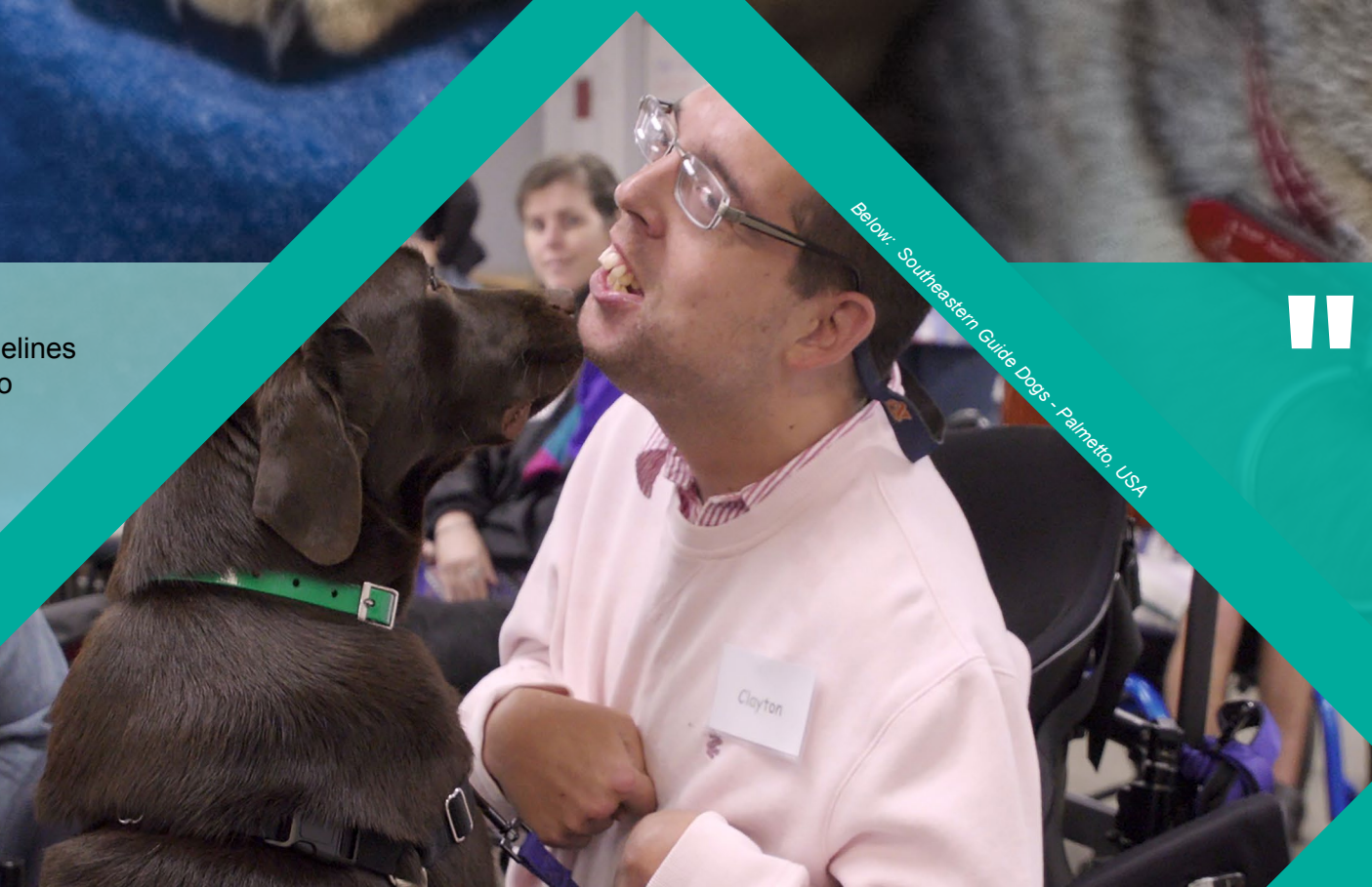
Below: Southeastern Guide Dogs - Palmetto, USA

Through Paws 4 Purpose™, Elanco will continue our engagement with animal welfare organizations through top-notch training and continuing education (CE) credits, as well as robust vaccination protocols.